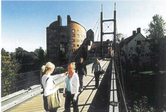
Campus at Mid-Sweden University in Sundsvall

Ever since SiTek invented and commercialised the modern PSD 28 years ago we have been known as the leader in PSD development. We have now further intensified our development efforts by starting a cooperation with the Electronics Design Division at Mid-Sweden University in