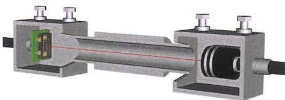
Figure 1. Principle sketch of the LASCA® measurement unit.

The measurement unit consists of a housing containing a laser in one end pointing at a PSD in the other. When a train passes the force on the rail will cause a vertical deflection of the laser beam. This deflection is measured by the PSD and can, by thorough signal analysis, be converted to information about wheel loads and wheel defects.