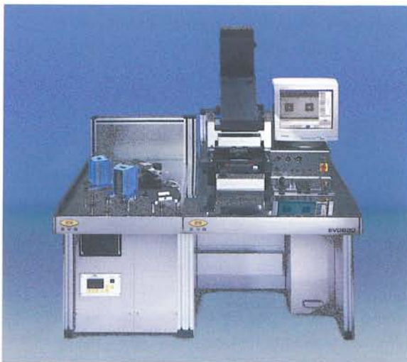
EV620 fully automatic mask aligner now used at SiTek

The manufacturing of the PSD chips is, like most semiconductor device manufacturing, done by adding layers of materials to a semiconductor wafer until the final structure has been created. Each layer has its special purpose, e.g. active area, metal contacts etc, and it needs an individual pattern to work properly. This pattern is defined by a mask aligner. Since the functionality of the complete PSD is built by the interaction between all these layers it is of greatest importance that the patterns of the layers are accurately aligned to each other. In fact, for some of our devices, the alignment between